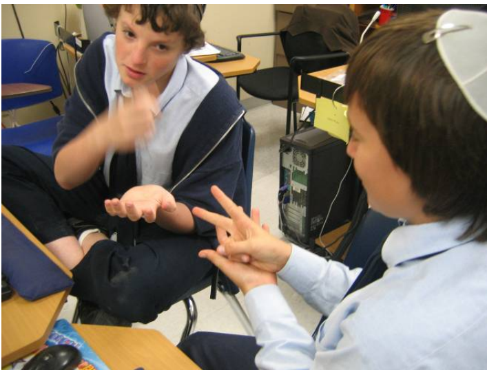
8 th Graders played "Rock, Paper, Scissors" to develop data to put in an Excel spreadsheet. They created a worksheet that included formulas and graphs.