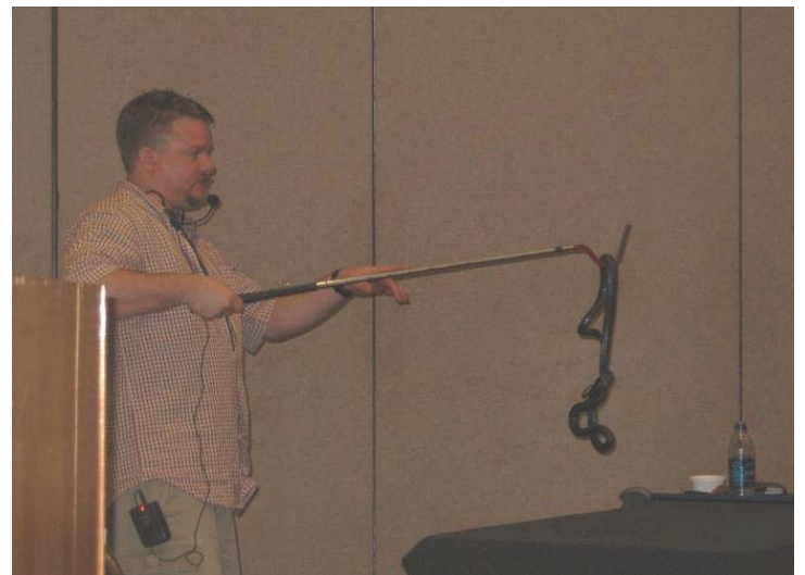
The Reptile Man showed students many different kinds of reptiles from lizards to turtles and snakes.