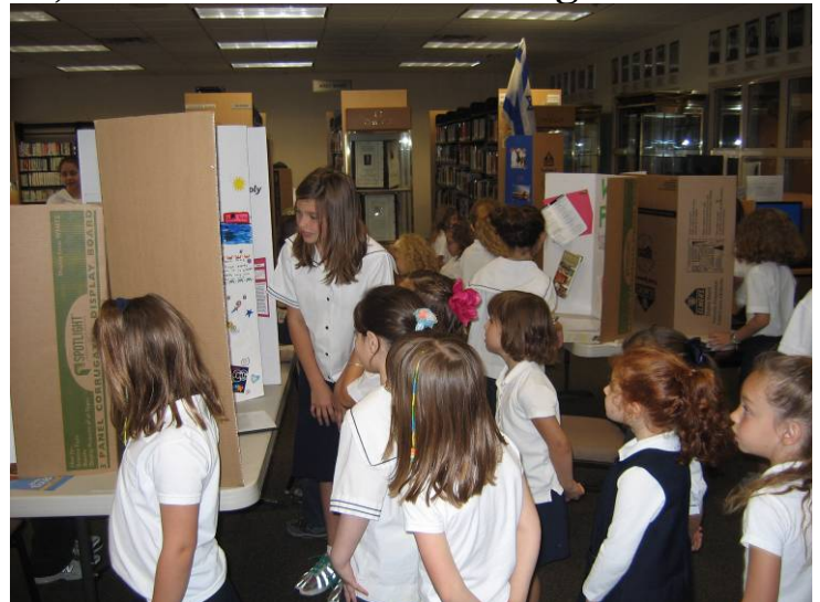
4 th Graders discussed their Texas Cities Projects with EKA Kindergartners.