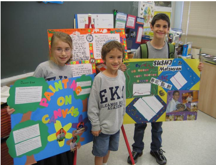
Here are a few of the fabulous "Can Do" projects completed by our very talented and skilled 2 nd graders.