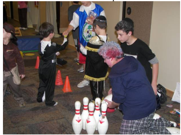
Middle School Carnival Workers