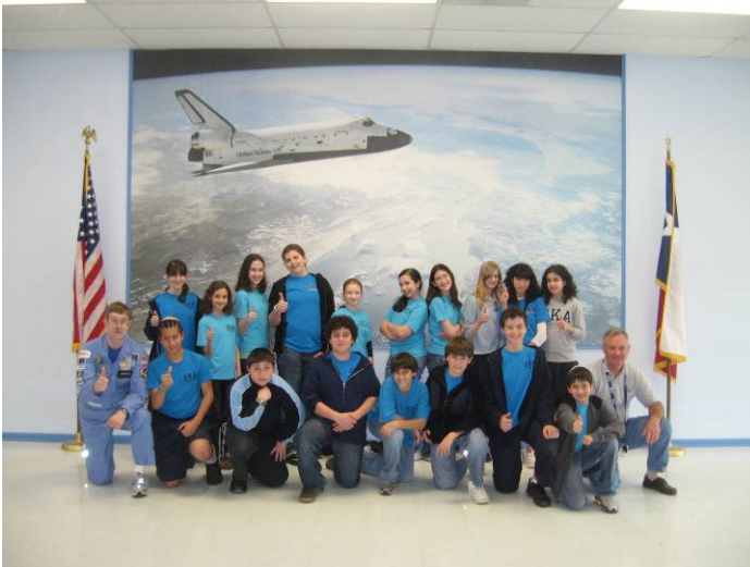
6 th and 7 th Graders participated in a "Trip to Mars" at the Challenger Center.