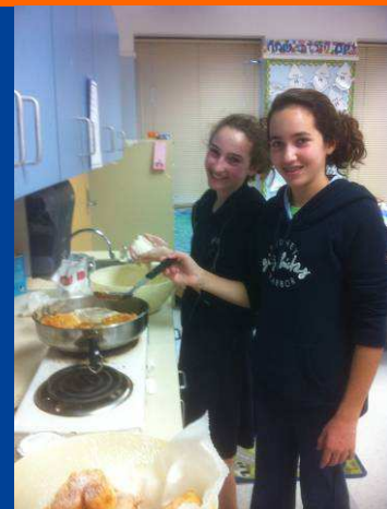
8 th Graders Helped with the cooking