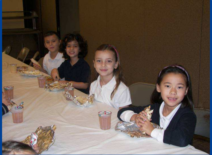
Mensch of the Month Breakfast