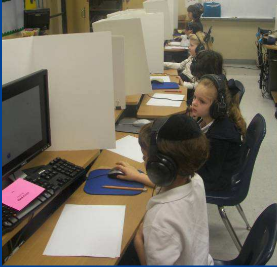
Kindergarten Online Testing