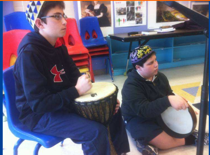
6 th Grade Music