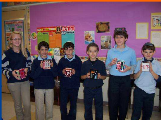
6 th Grade Needlepoint Project