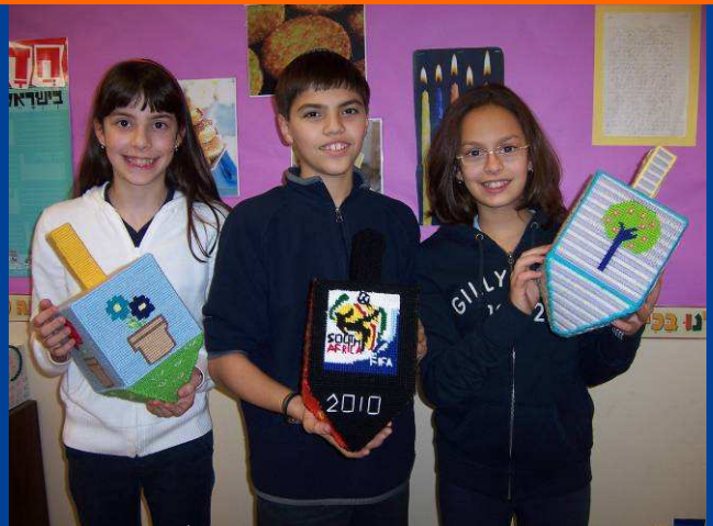
7 th Grade Needlepoint Project