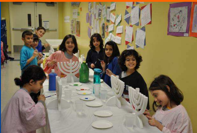
2 nd Graders Made Chanukiyot