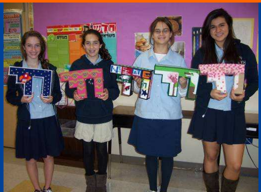
8 th Grade Needlepoint Project