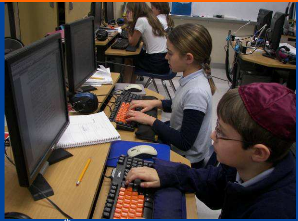
5 th Grade Keyboarding Practice