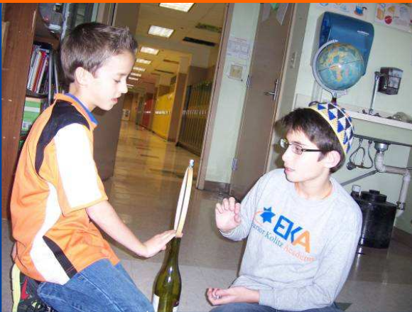
6 th Grade Science