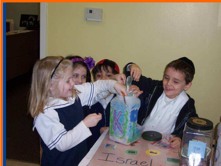
Knesset Penny Contest for Tzedakah