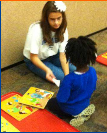
8 th Graders Helped with the JCC Chanukah Experience