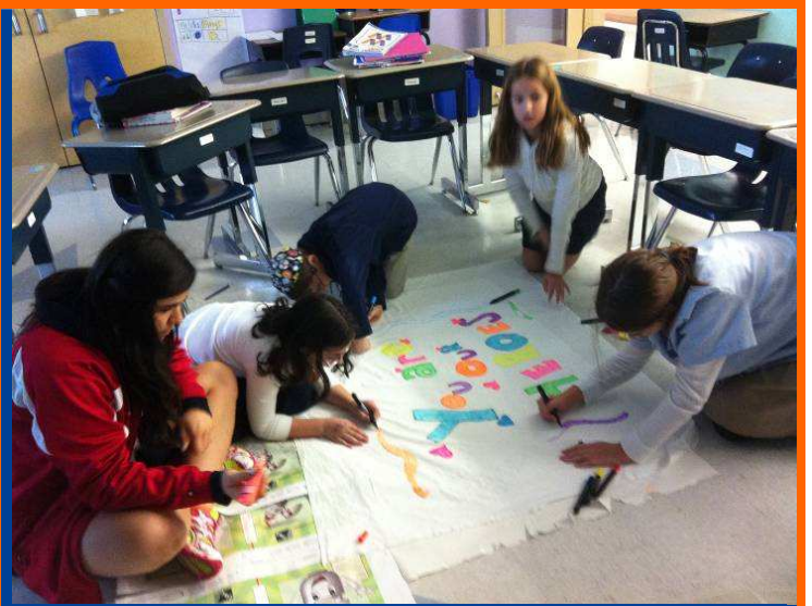
Banners for Our Soldiers