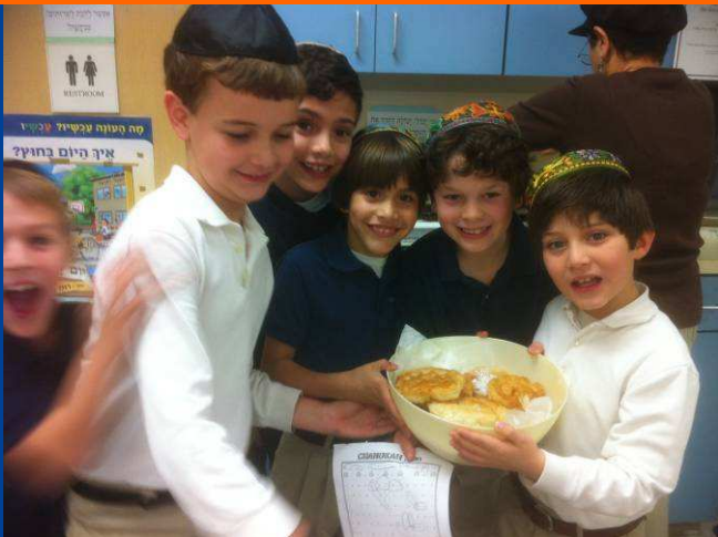
3 rd Grade Sufganiyot