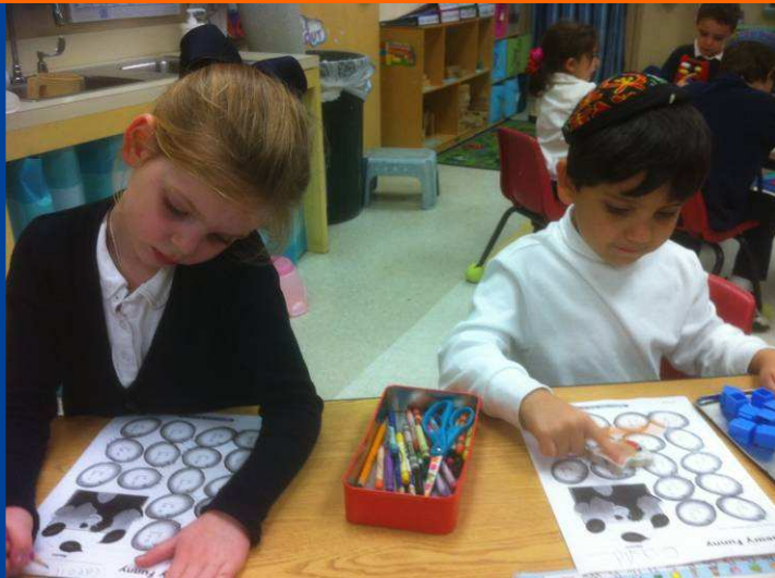
Math in the Kindergarten