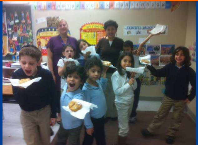
Sufganiyot in 2 nd Grader