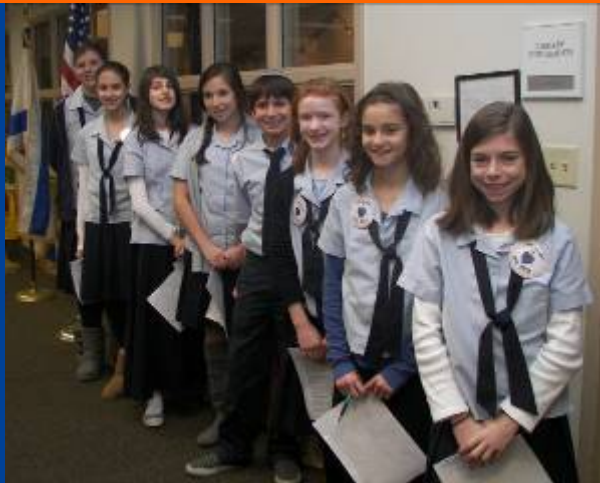
EKA Tour Guides