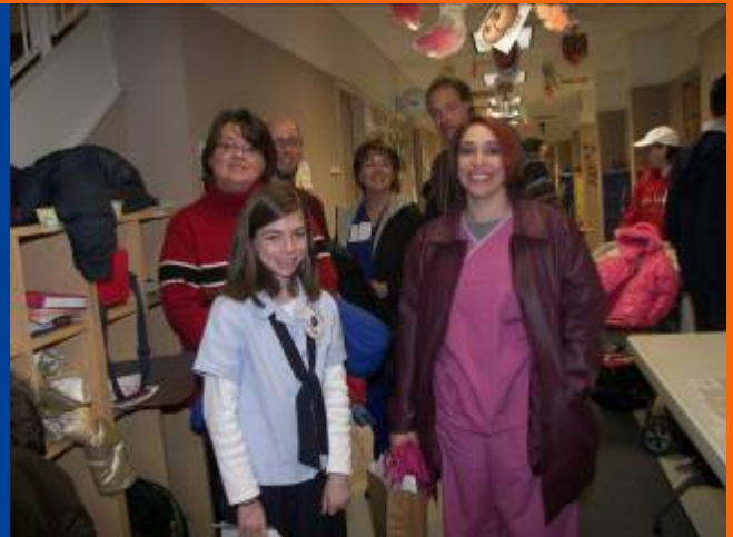
Kindergarten Roundup Tour