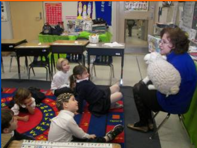
09-10 Kindergarten Visited First Grade