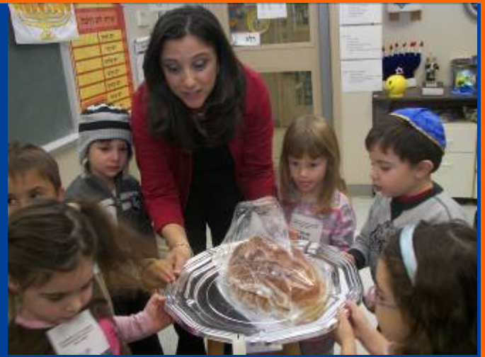
Future Kindergartners Visited Kindergarten