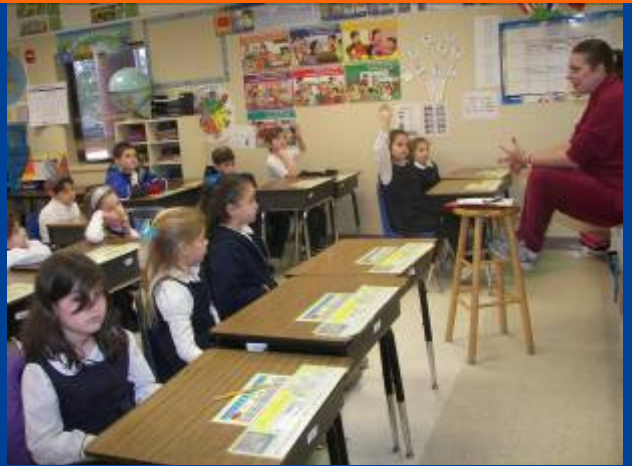
2 nd Graders visited 3 rd Grade