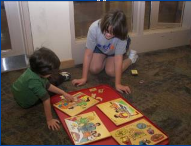
6 th Graders Helped JCC Pre-school at Chanukah Celebration by monitoring games.