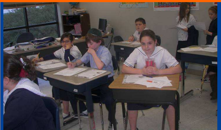
4 th Graders Try Out Middle School Social Studies