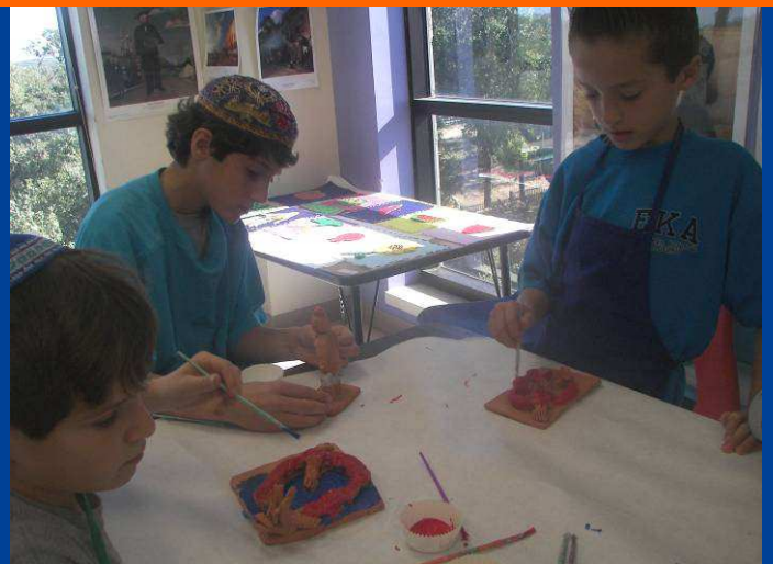
6 th Grade Artists