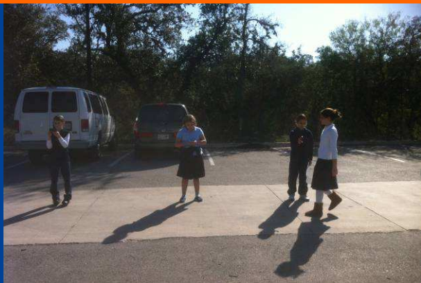
5 th Graders Get Real World Practice Studying Velocity