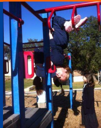
4 th Graders Get Their Daily Exercise