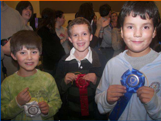
3 rd Grade Finalists