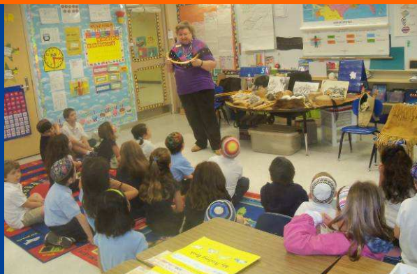
1 st Graders Learned About Native Americans