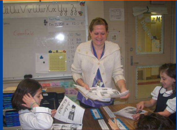
2 nd Graders Stepped up to 3 rd Grade Judaics