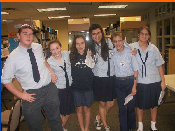
8 th Graders Were Outstanding Tour Guides