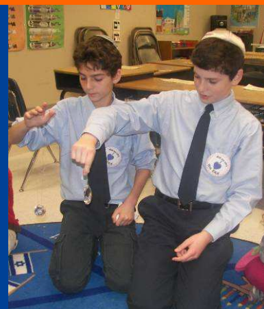
7 th Graders Assisted in Classrooms