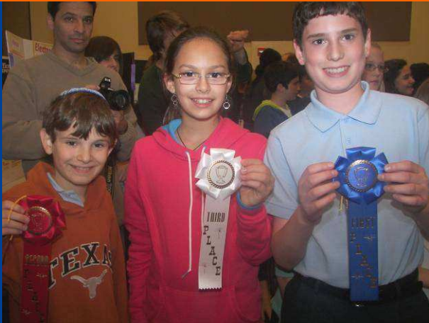
Middle School Winners