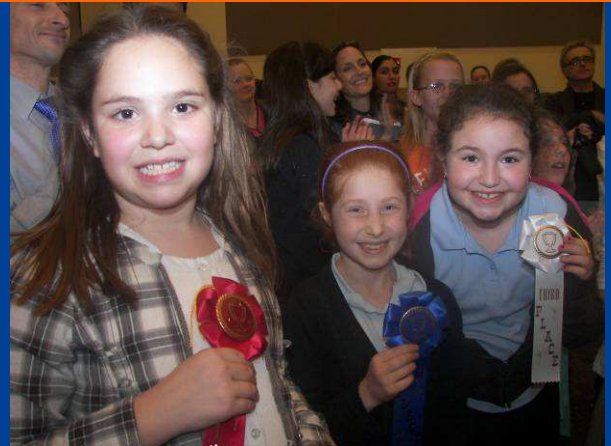
4 th Grade Winners