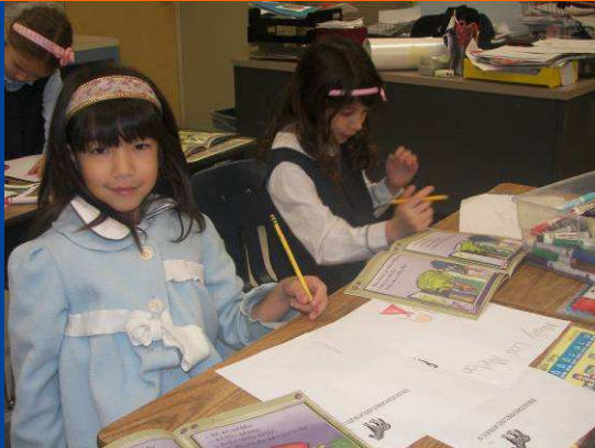
1 st Graders Stepped up to 2 nd Grade Hebrew