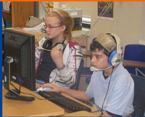
Rosetta Stone Language Elective