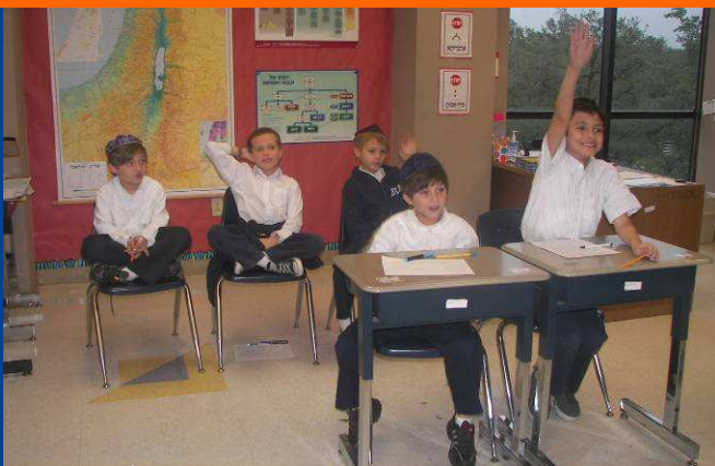
3 rd Graders Enthusiastically Stepped Up