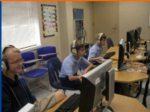
Rosetta Stone – Learn a language at your own pace.