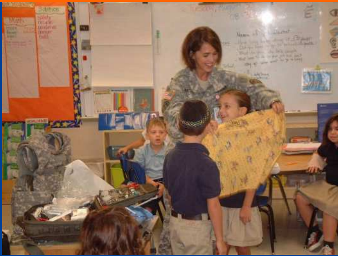
First Grade visitor for study of community workers.