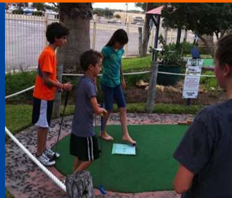
Middle Schoolers at their first social.