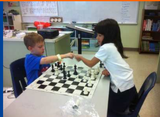
Chess (After School Activity)