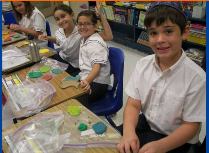
Fourth Graders create maps of Texas.