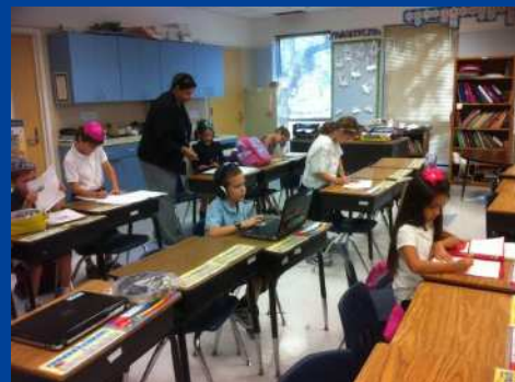
Homework lab – do your homework, even if it's on the internet. Wifi available.